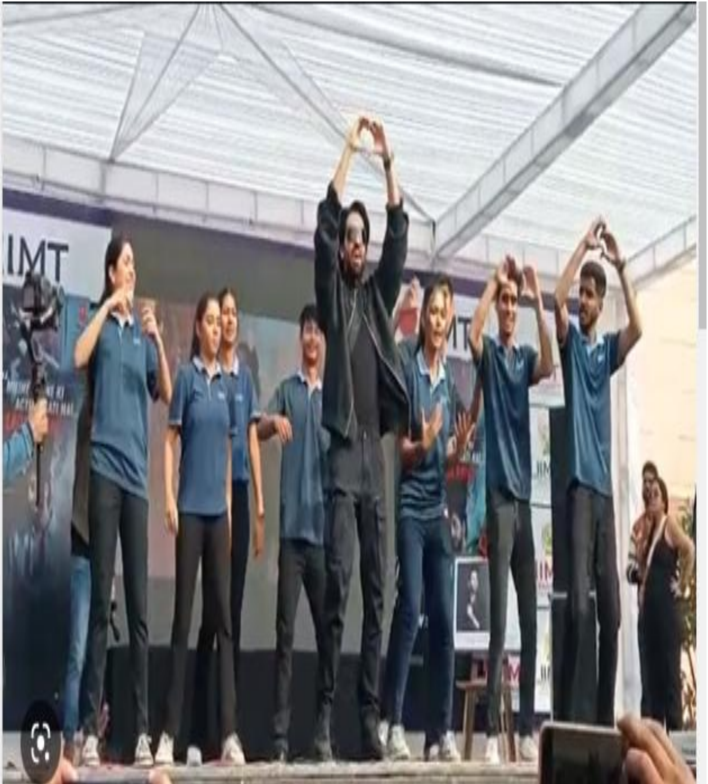
Ayushmann Khurrana entertaining the IIMT Fraternity