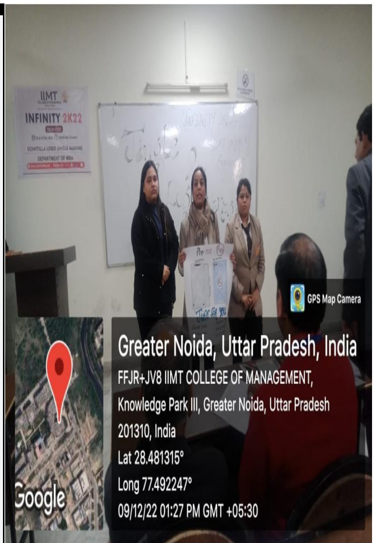
Students displaying their artwork at the event